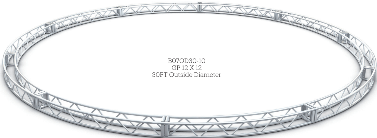
B07OD30-10 GP 12 X 12 30FT Outside Diameter

IF CIRCLES ARE HUNG IN A VERTICAL POSITION, DIAGONALS MUST BE IN ALL FACES