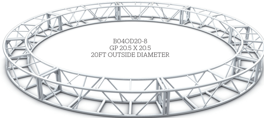
B04OD20-8 GP 20.5 X 20.5 20FT OUTSIDE DIAMETER

CIRCLES AND CUSTOM SHAPES CAN BE FORMED IN ANY TRUSS SIZE BASED ON CLIENT NEEDS