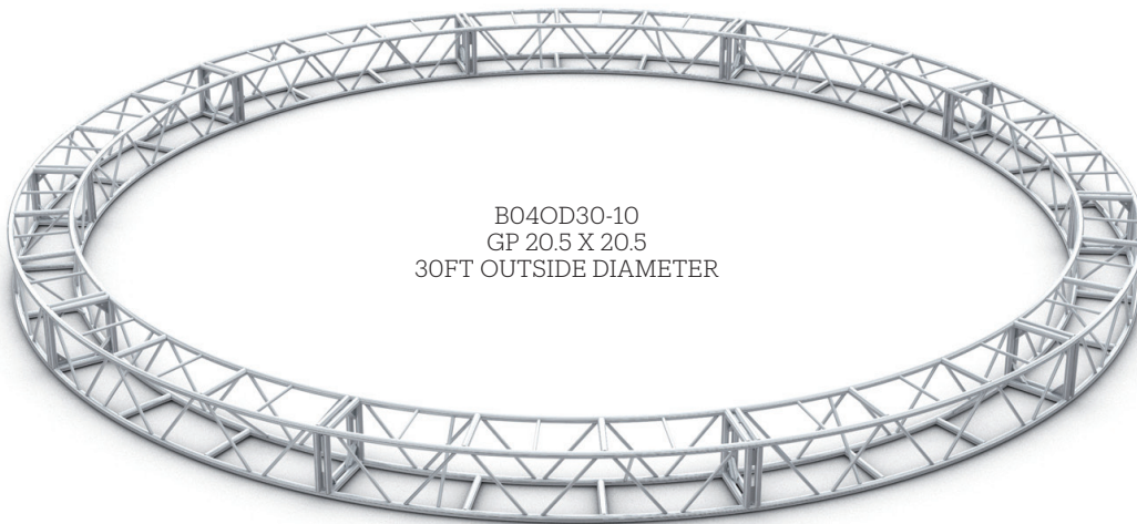
B04OD30-10 GP 20.5 X 20.5 30FT OUTSIDE DIAMETER

CIRCLES AND CUSTOM SHAPES CAN BE FORMED IN ANY TRUSS SIZE BASED ON CLIENT NEEDS